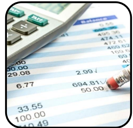
FINANCE & ACCOUNTS