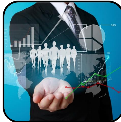
HR & PAYROLL